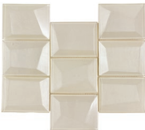
Peau De Sol Crème